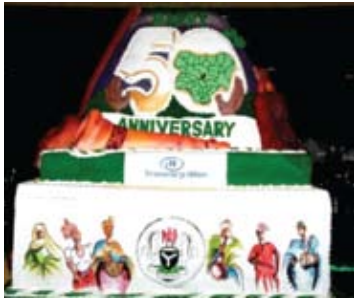
50 Years of Independence Celebration Cake

It was official celebration time for Aso Villa, seat of the Presidency in the federal capital territory, Abuja which hosted a state banquet and several other events. This was well attended by African and European heads of state, government representatives and the crème de la crème of Africa's business and diplomatic circles.