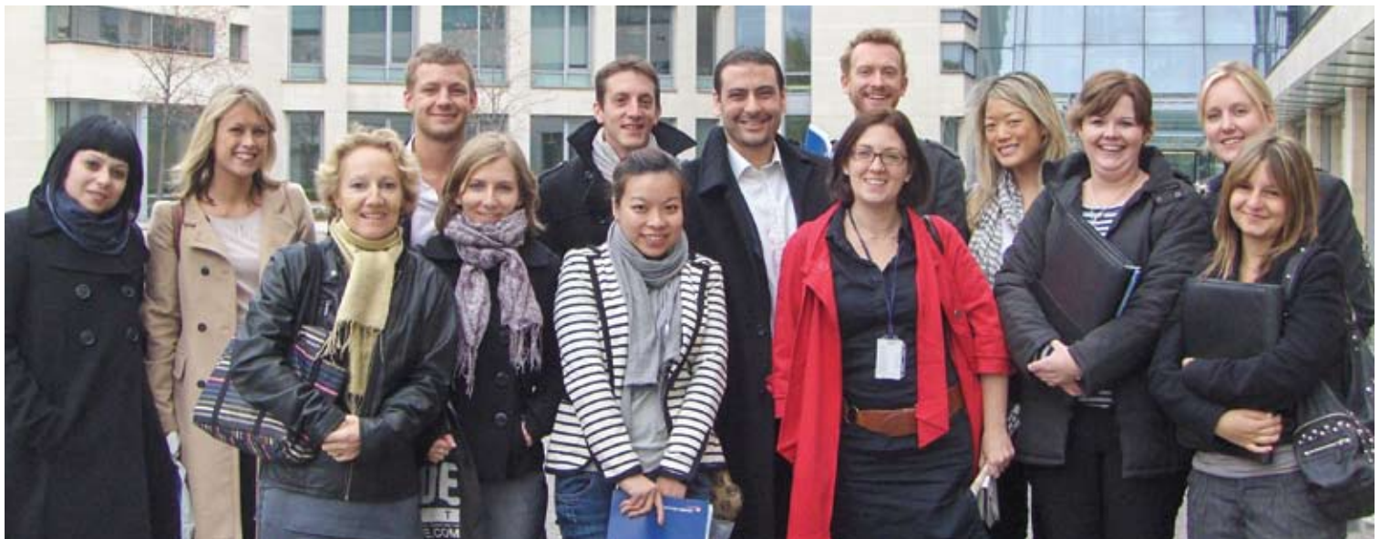
BA South Africa team visits Waterside