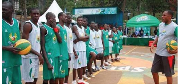
Former NBA star Steven Smith conducts a basketball clinic ahead of Sprite Slam Basketball Finals.

Smith has plied his trade in the NBA for 14 years with teams such as the Miami Heat, Portland Trail Blazers, San Antonio Spurs, New Orleans Hornets and the Charlotte Bobcats. Thanks to the efforts of our team, there was huge media turn out.