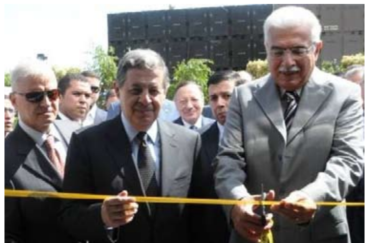
Dr. Ahmed Nazif & Minister Rachid at the Opening of the Makro Store