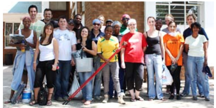
FHSA staff get ready to paint the new CIDA campus

The FH staff were quick to volunteer their time and staff members joined hands with CIDA to accelerate the refurbishment of the new premises in time for 2011's admissions and accommodation.