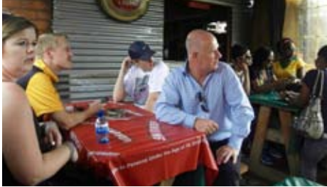
FH Staff in a Soweto Shebeen