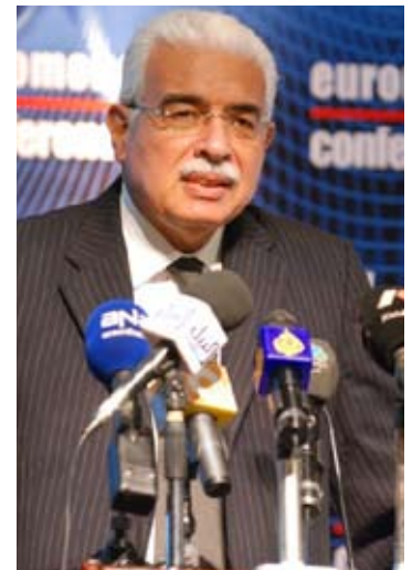
Dr. Ahmed Nazif giving the closing Speech at the Euromoney Conference