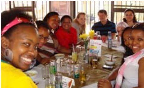
FH Staff and Affiliates at Lunch in Soweto