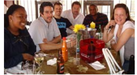
FH Staff at lunch in Soweto