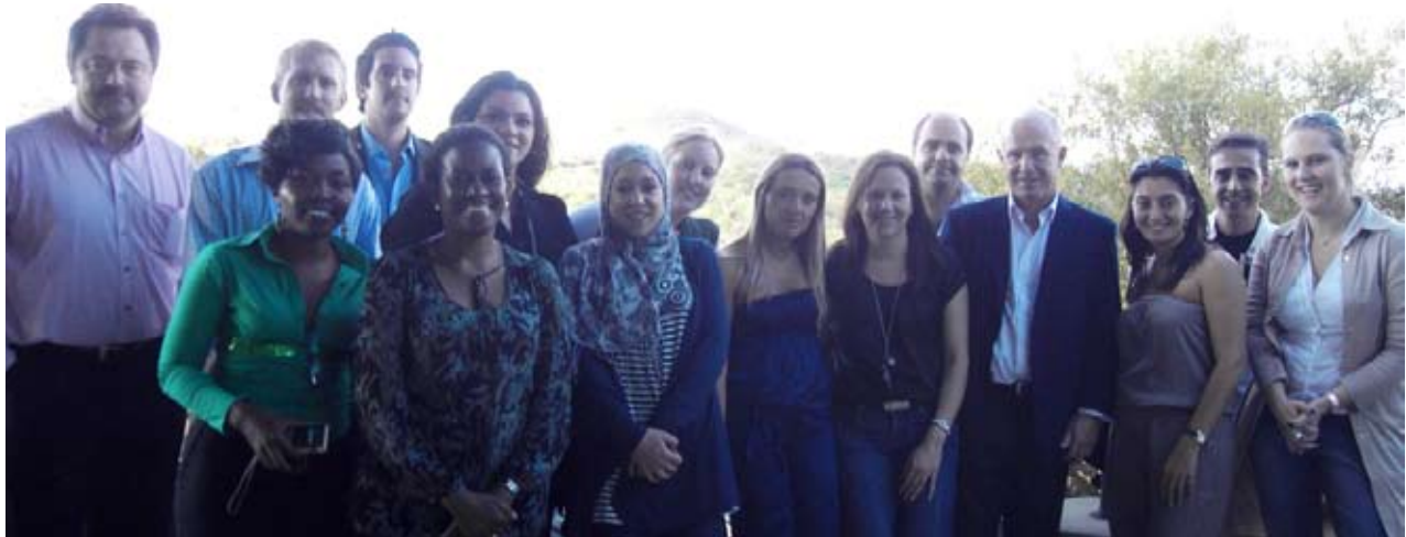
The FH African Network enjoying the South African Sun

Looking after your needs in Angola and Mozambique