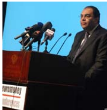
Former Minister Moheldin giving the opening Speech at the Euromoney Conference

Amongst the delegates were the Prime Minister of Egypt, H.E. Ahmed Nazif, and 4 other high-profile ministers. TRACCS secured the attendance of over 100 journalists to cover the event and coordinated interviews with key Euromoney