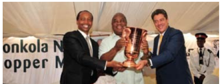
L-R: Patrice Motsepe, Executive Chairman of ARM; President Rupiah Bwezani Banda, President of the Republic of Zambia; Roger Agnelli, CEO of Vale

Vale, which is the world's second largest diversified mining company, contracted Cutting Edge PR to manage the media relations for this event. Print and electronic media coverage attained was extensive.