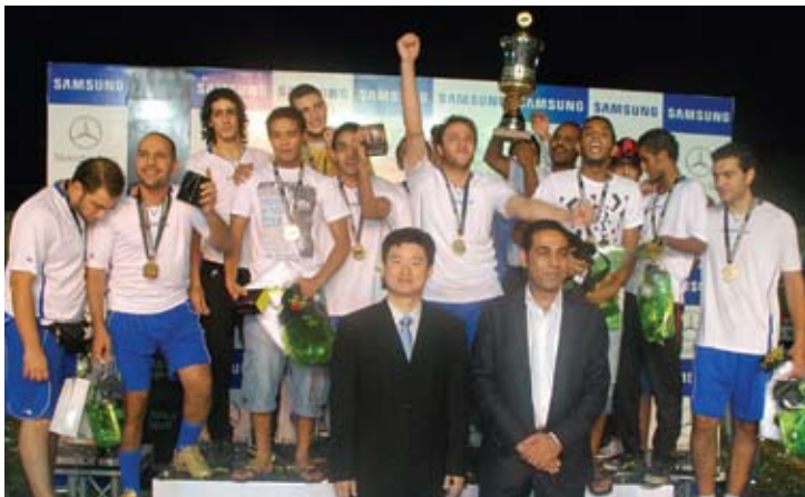
Samsung's Star Corporate Football Tournament

The project is supported by a grant from Samsung and is being implemented by the International Youth Foundation (IYF) and local partner organization, Nahdet El Mahrousa (NM). Samsung was also the lead sponsor in the "Egypt's Race for the Cure," which was organized by the first lady, Suzanne Mubarak's Women's Health Outreach Program (WHOP) and will take place on October at the Great Pyramids of Giza.